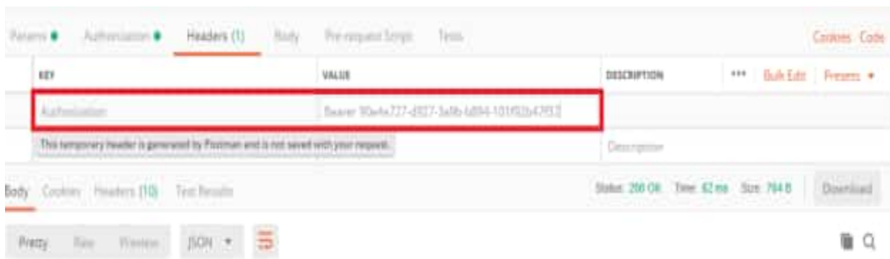
Figure 2 Security Key added with the word "Bearer" will be passed on in Value of parameter Authorization

Figure 1 below illustrates how to pass this token in the header of each request using Postman.